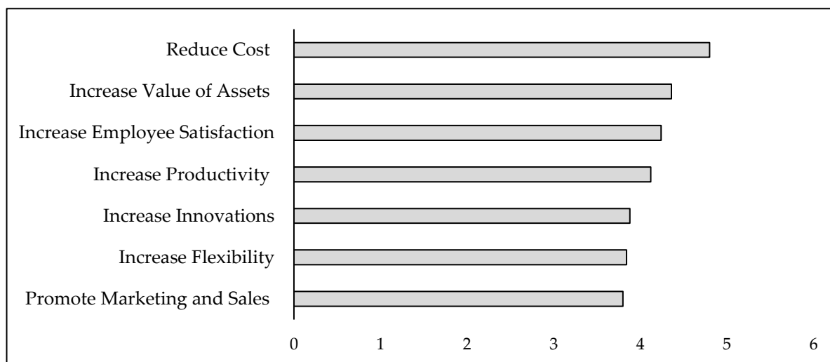
Figure 4. Value Adding Attributes of Corporate Real Estate